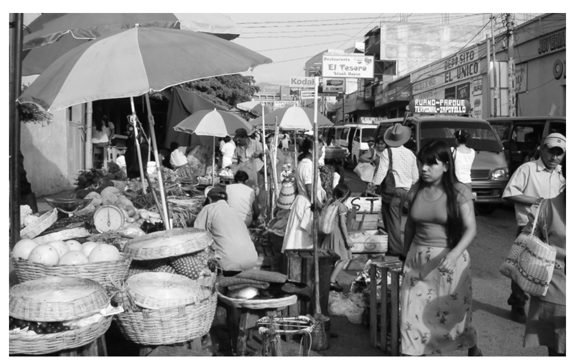
Market in Chiquimula, Guatemala

Oftentimes trafficking cases, like Pablo's, involve more than one victim. It is common to attempt to locate