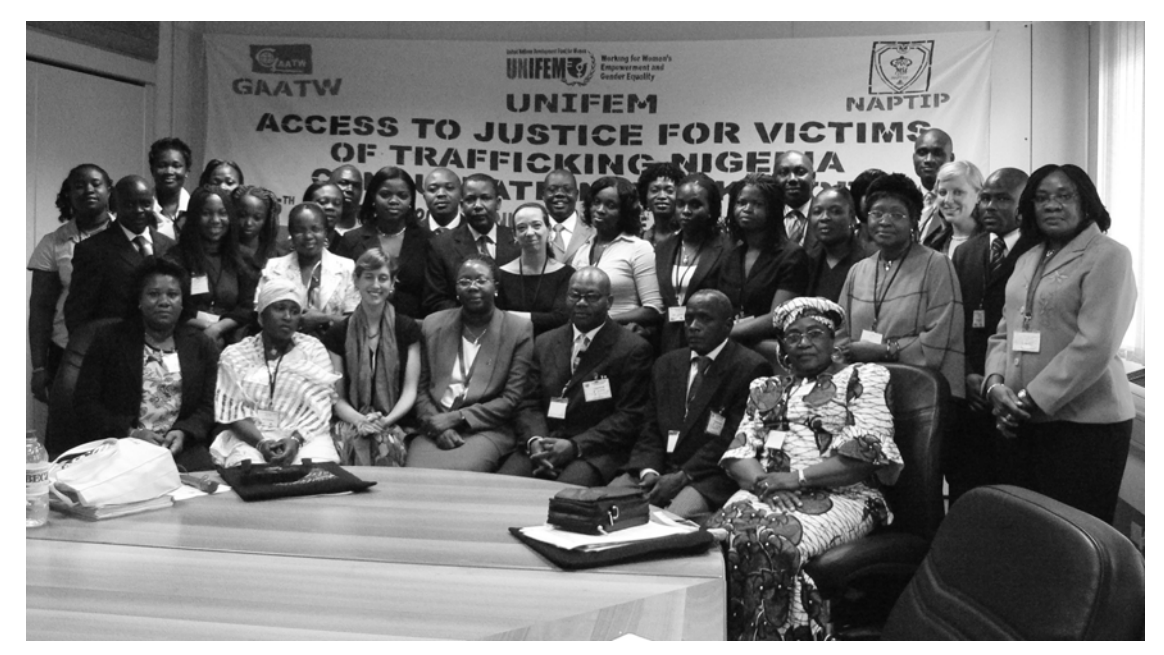
Workshop on Access to Justice for Trafficked Persons in Nigeria

consultation was co-organised with UNIFEM Nigeria, and the National Agency for Prohibition of Trafficking in Persons (NAPTIP). The aim of the meeting was for participants to share experiences and identify the obstacles that survivors of trafficking face in accessing justice, and also to make recommendations for all actors