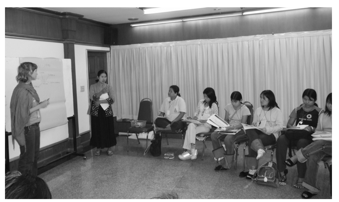
AtJ workshop during the Women's Exchange Get-Together in Chiang Mai

Self-organisation, self-representation and self-help are some of the principles that GAATW has consistently promoted in its work. GAATW's engagement with selforganised groups initially occurred with sex worker groups, when the Alliance advocated for the inclusion of sex workers' voices within antitrafficking discourses. GAATW has supported self-organised groups in various ways such as facilitating group goals for visibility and