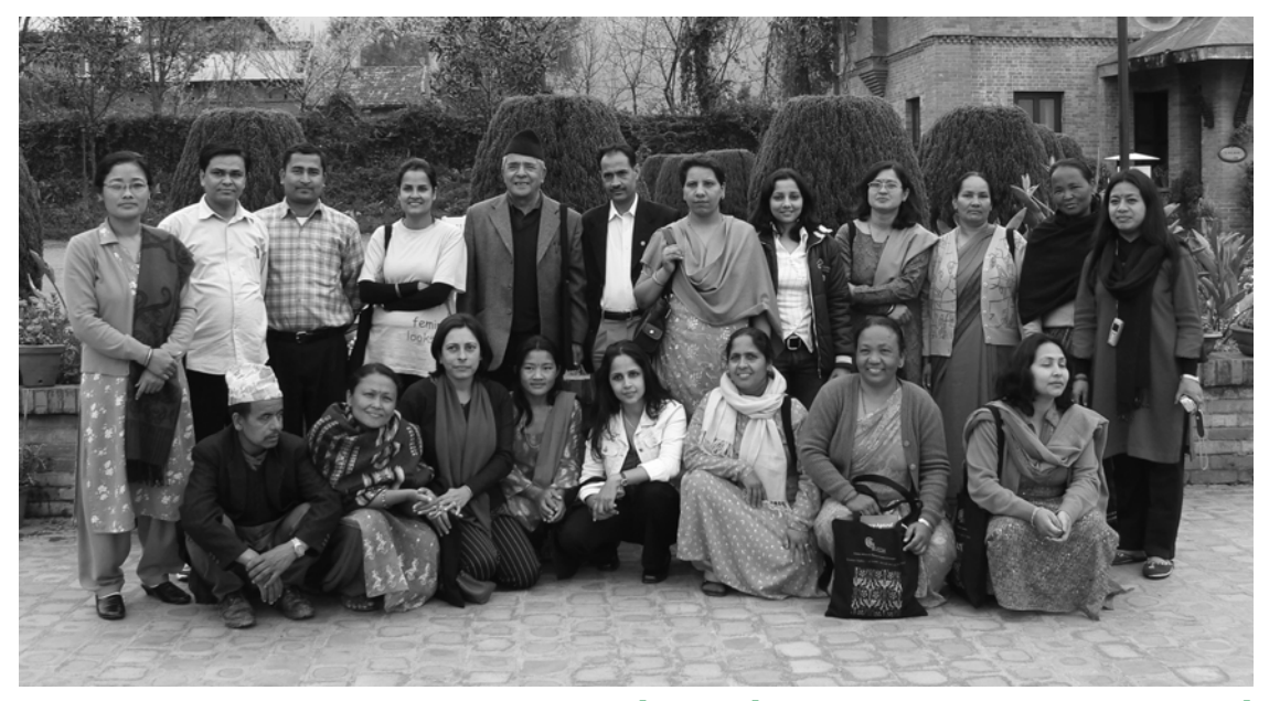
National Consultation on Access to Justice, Nepal