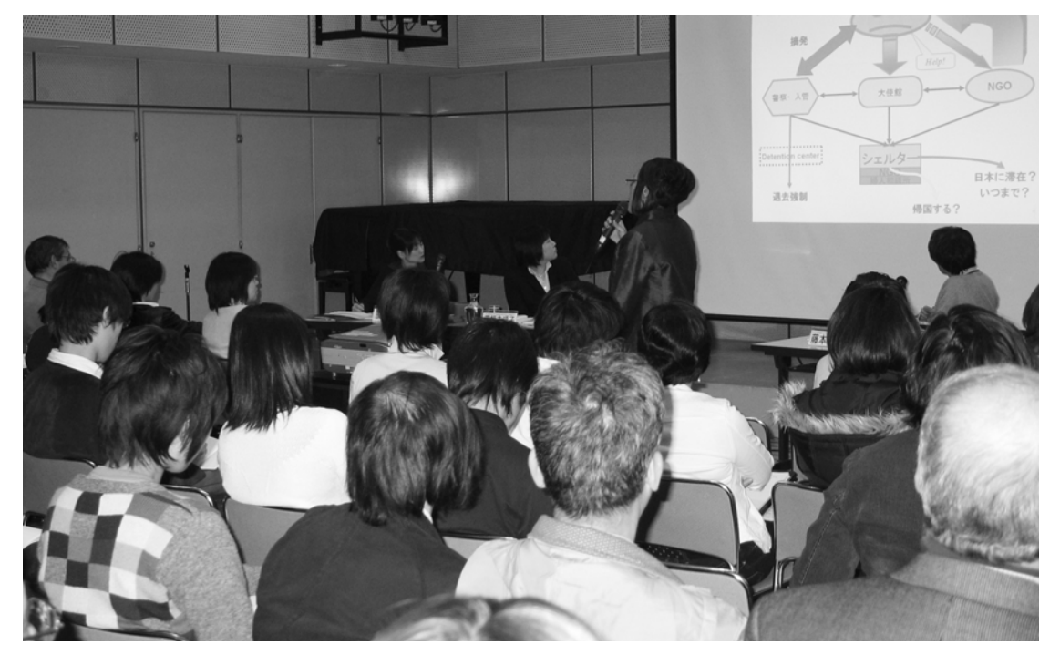
Workshop on TIP hosted by JNATIP and the Asia Foundation

Our major priorities at present in JNATIP are to lobby the government to improve victim protection (including compensation for loss), and to raise public awareness on trafficking in persons in Japan.