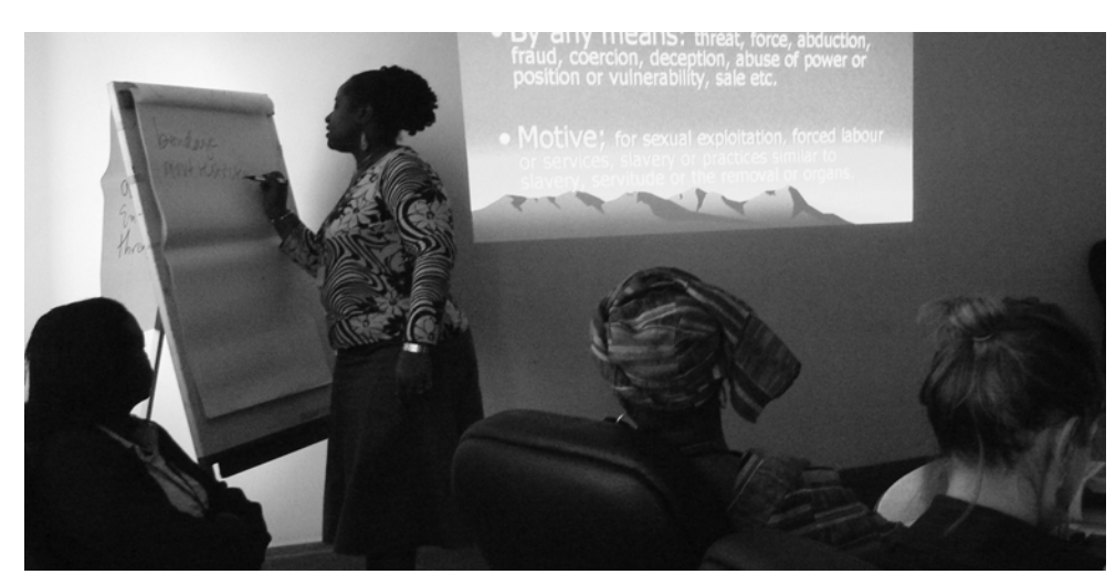
The Nigeria Consultation

2. Amendment of the NAPTIP Act to allow NAPTIP to pursue civil claims on behalf of the victims.