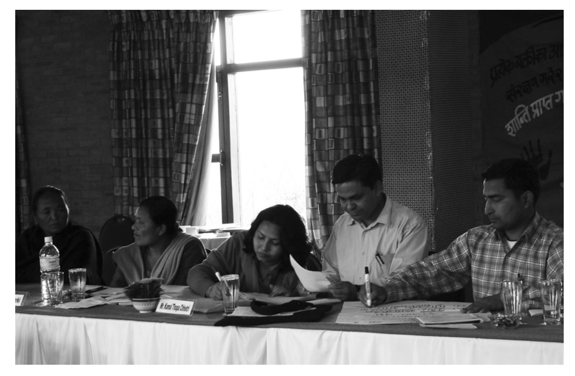
Nepal Consultation in progress

Survivors participating in the Global Consultation seemed to have different views on the significance of what compensation meant to them. One of the survivors echoed her frustration by saying: "In the end the defendants were convicted but we did not get justice. It can be called justice if there is fair punishment, if compensation is paid and the root causes of the crime are eliminated. But the defendant just walked out of court and is still at large. Also, as far as compensation is concerned, we were awarded $40,000