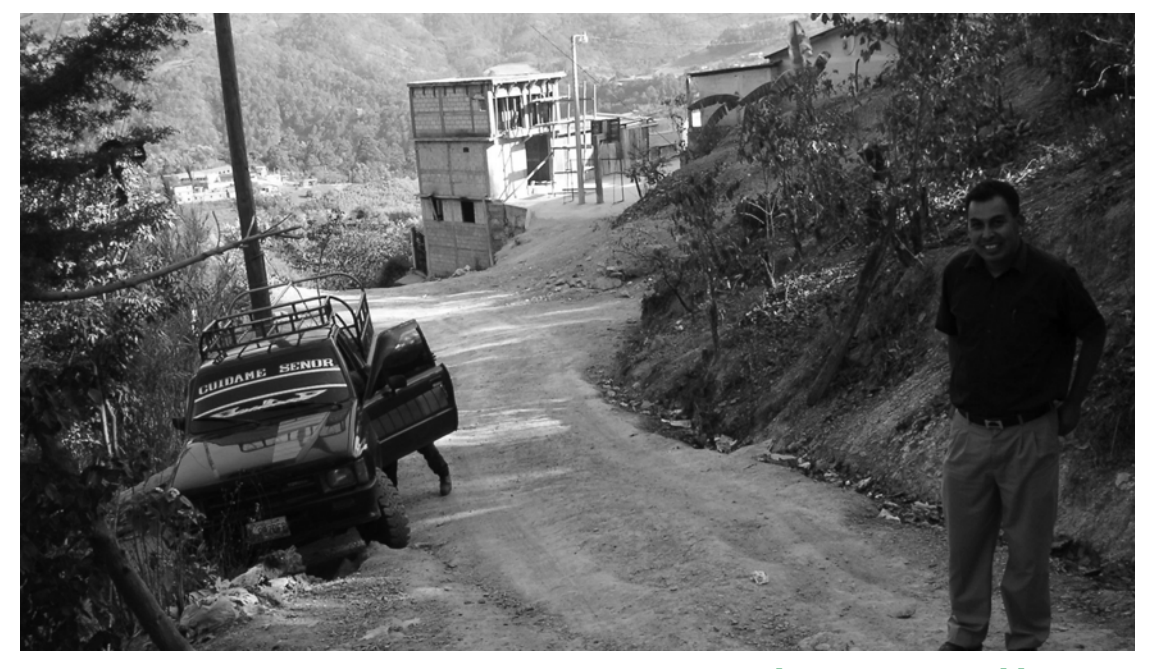
Implementing portable justice

claim. Without portable justice, most migrants must abandon their legal claims or criminal cases once they decide they want to go home. This encourages traffickers and other abusers of migrants to continue their operations with impunity. Pursuit of justice should not be linked to and limited by the victim's physical location.